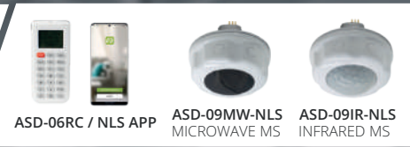
ASD-06RC / NLS APP